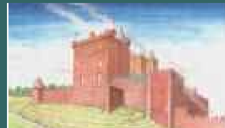
An artists impression of MacDuff castle